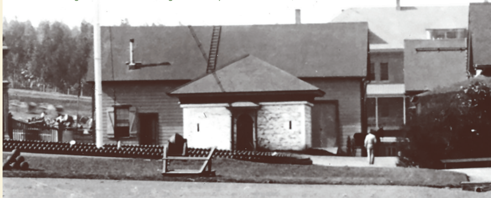
The Powder Magazine and surrounding American period structures, c.1900.

Tree Fall is temporarily closed. Please check our website at presidio.gov for updates.